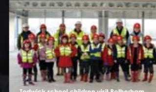
Todwick school children visit Rotherham

“ We're a truly dedicated team ready to drive the business forward.”