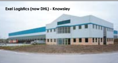
Exel Logistics (now DHL) - Knowsley