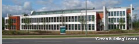
'Green Building' Leeds