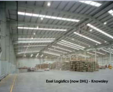
Exel Logistics (now DHL) - Knowsley