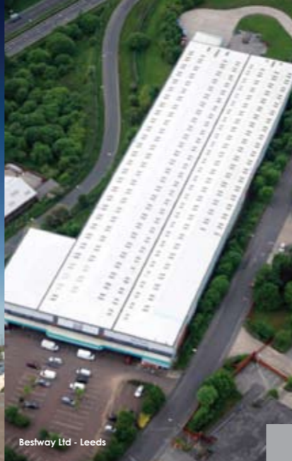
Bestway Ltd - Leeds