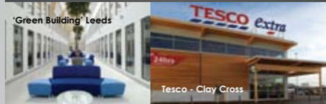
Tesco - Clay Cross