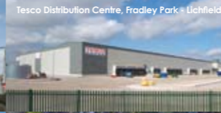
Tesco Distribution Centre, Fradley Park - Lichfield