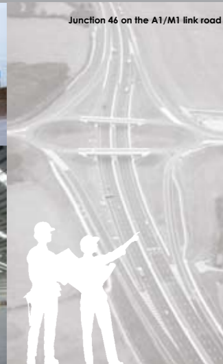
Junction 46 on the A1/M1 link road