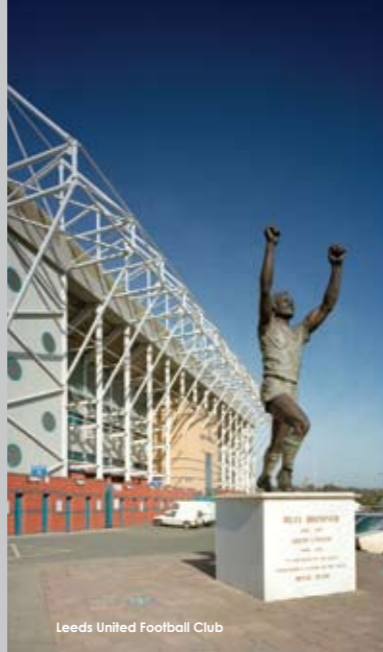
Leeds United Football Club