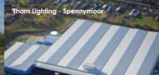
Thorn Lighting - Spennymoor