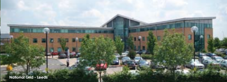
National Grid - Leeds

1994 The start of an ongoing successful relationship with Rex Procter & Partners A new petrol filling station was built for J Sainsbury PLC in Bradford Construction of a warehouse and offices in Birmingham for Severn Trent Property Ltd